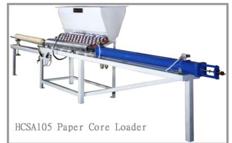
HCSA105 Paper Core Loader